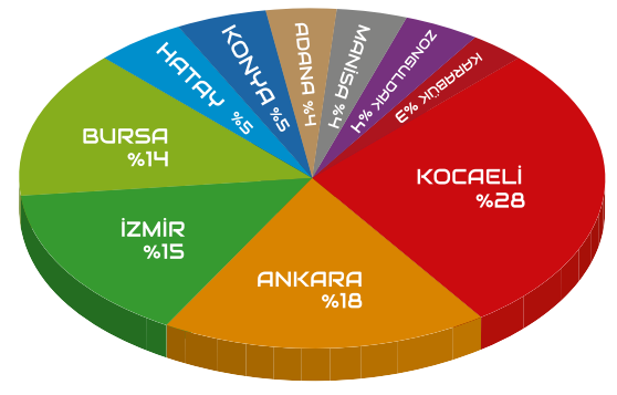
TOP TEN VISITING CITIES OF TURKEY

Iron steel industry professionals from 47 different cities of Turkey visited Metal Expo 2021.